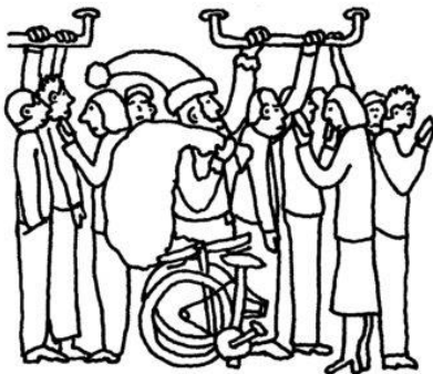
FOLDING BIKE: TO TAKE ON THE TRAIN