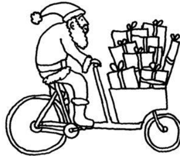
CARGO BIKE: FOR ALL OF THE PRESENTS