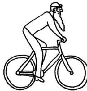
FIXIE: MAINLY USED BY SANTA'S TRENDY BROTHER IN LONDON