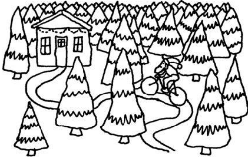
MOUNTAIN BIKE: FOR REACHING THE GROTTO IN THE WOODS