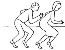
ARRIVE AND LEAVE QUIETLY