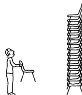
STACK THE CHAIRS AS YOU FOUND THEM