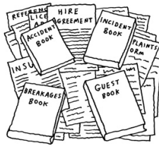
FILL IN THE PAPERWORK