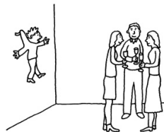
DON'T STICK ANYTHING ON THE WALLS