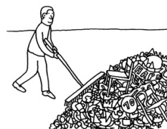
CLEAN EVERYTHING UP