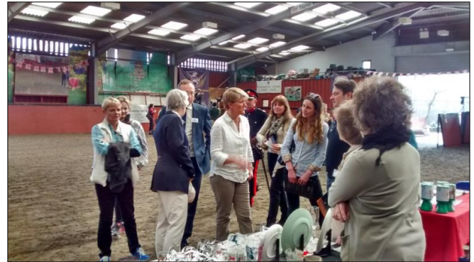
Clare Balding at Wormwood Scrubs