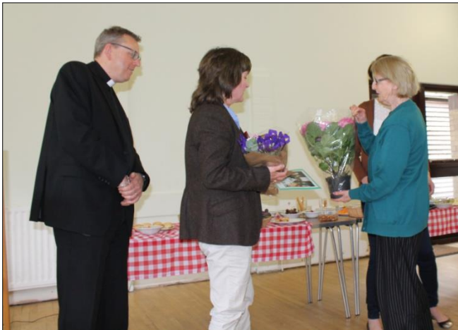
With all our love and thanks...