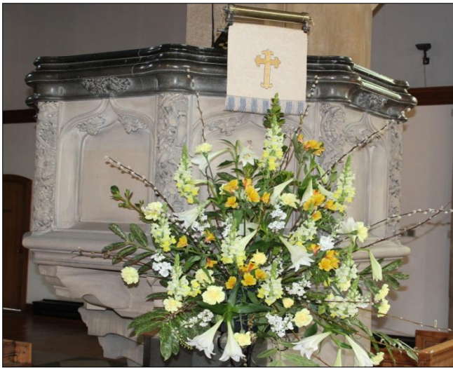
The splendour of the Season in white and gold.