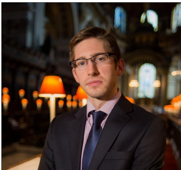
Our St Peter's Day recitalist at St Paul's.