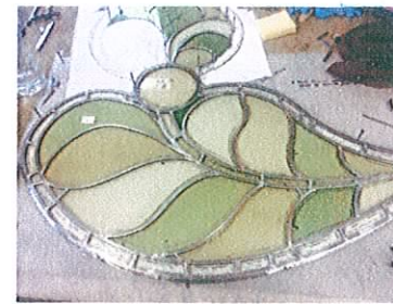
Rubbings of tracery made, old lead carefully removed and new lead made