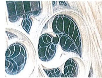
Typical views of the window showing the decayed leadwork to the tracery