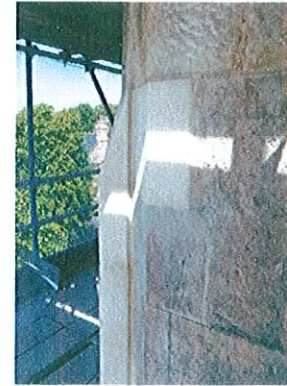
Newly completed stones to north tower