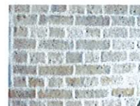
Newly pointed brickwork

THE PROJECT TEAM: ST PETER'S CHURCH PCC, HISTORIC ENGLAND, HERITAGE LOTTERY FUND, RODERICK MACLENNAN ARCHITECTS LTD, MS LOCK AND SONS LTD, CHAPEL STUDIOS STAINED GLASS LTD, WELLS STONEMASONS, SAWYER AND FISHER, ANDREW GODDARD ASSOCIATES