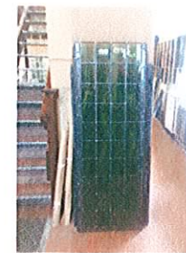
Completed windows ready to go back