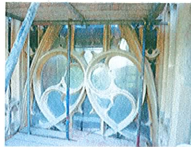
Stained glass carefully numbered and removed to the workshop