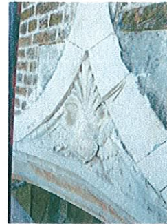
Stone mouldings being cut out