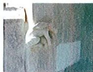
Newly carved corbel